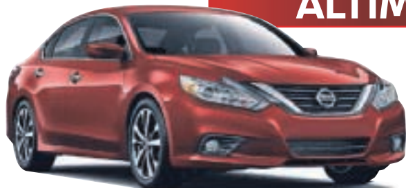
2.5 SR model shown*