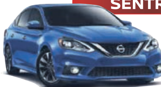
1.8 SR model shown*