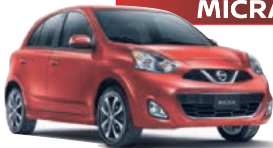
SR AT model shown*

GET UP TO $2,000 LOYALTY BONUS! WE'RE SHOWING OUR APPRECIATION TO CURRENT NISSAN CUSTOMERS AND NOW GIVING EXCLUSIVE ACCESS TO THOSE WHO OWN OR LEASE A TOYOTA, HONDA OR HYUNDAI MODEL.