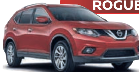
SL AWD Premium model shown*