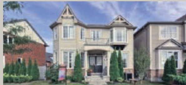
355 Country Glen Road, Markham

Fantastic layout!! 4 bedroom Detached Family Home with Attached 2 Car Garage and Parking Pad. Mudroom leading to the Family Sized Kitchen with Island. Bright and Spacious Family Room that Overlooks the Backyard. Gas Fireplace and 9' Ceilings. Within walking distance to parks, schools, community center, hospital and transit.