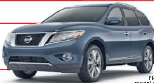
Platinum model shown †

IN STANDARD RATE FINANCE CASH ON 2016 PATHFINDER PLATINUM 4X4