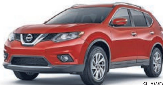
SL AWD Premium model shown †