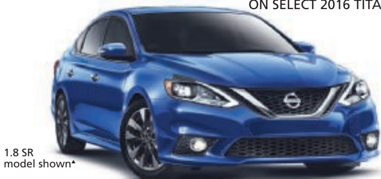
1.8 SR model shown †