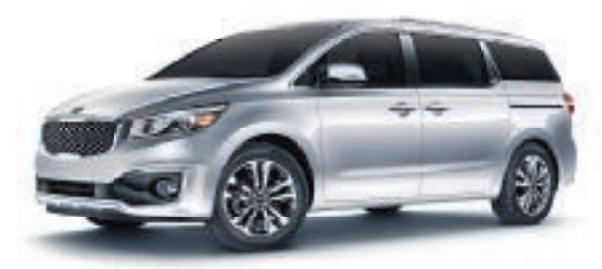
Sedona SXL+ shown<sup>‡</sup>