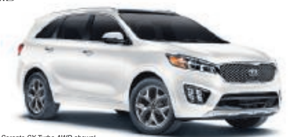
Sorento SX Turbo AVVD snown-

AVAILABLE FEATURES: 8-PASSENGER SEATING, 2ND ROW 'SLIDE-N-STOW VOICE-ACTIVATED NAVIGATION SYSTEM