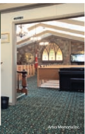
Arbor Memorial Inc.