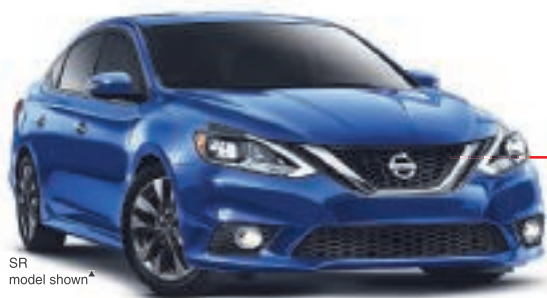
SR model shown*