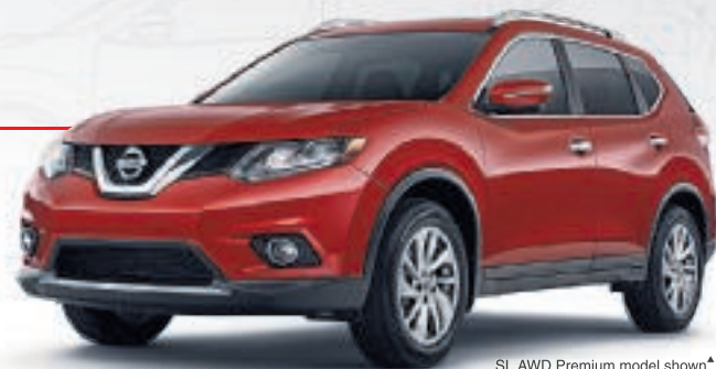
SL AWD Premium model shown*

FEATURING: • ALUMINUM-ALLOY WHEELS • HEATED FRONT SEATS & MORE