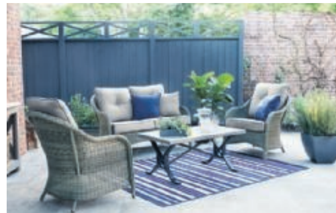
Debbie Travis Rousseau Conversation Set, Debbie Travis Outdoor Rug, Debbie Travis Reversible Accent Cushion.

Think functionality: Multi-functional furniture is a necessity. "Innovative materials and exotic forms promote dual-purpose de-