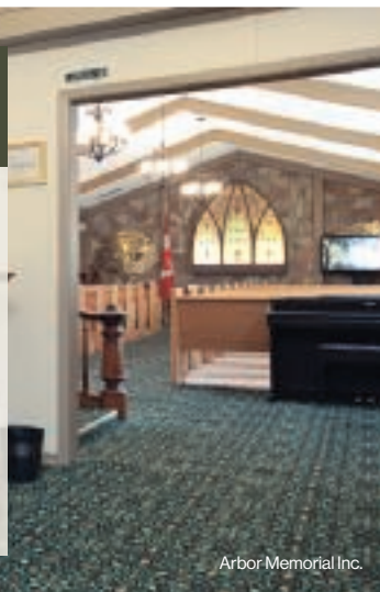
Arbor Memorial Inc.

6324 Main Street, P.O. Box 639, Stouffville oneillfuneral.ca