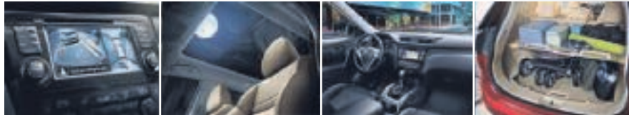
AROUND VIEW® MONITOR

AVAILABLE FEATURES ON OTHER ROGUE TRIMS: