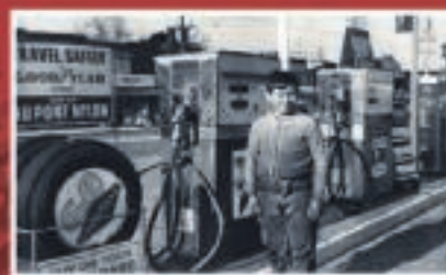
Pumping Gas Age 10 at Uncle's garage Danforth and Greenwood, Toronto