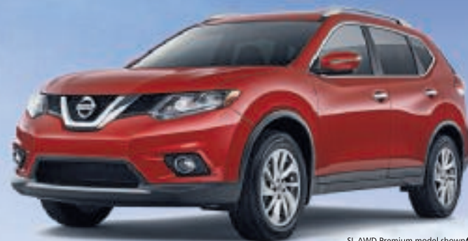
SL AWD Premium model shown*