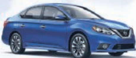
1.8 SR model shown*

LEASE* FROM $189 MONTHLY WITH $0 DOWN THAT'S LIKE PAYING ONLY