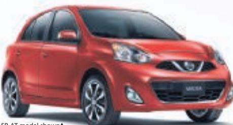
SR AT model shown*

LEASE* FROM $149 MONTHLY WITH $0 DOWN THAT'S LIKE PAYING ONLY