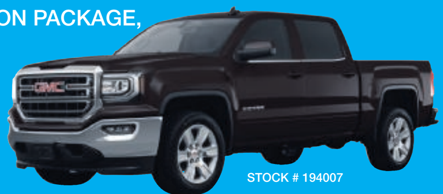
STOCK # 194007

LEASE: 24 MONTHS 0% RESIDUAL $28,210 $0 ON DELIVERY $0 FIRST MONTH PAYMENT $128* WEEKLY