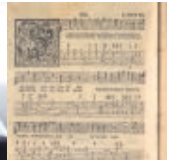
THE TUDOR CONSORT

STOUFFVILLE'S FEARLESS ALT-FOLK TROUBADOUR