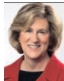
Dr. Helena Jaczek

We will also be ensuring that no eligible student