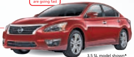
3.5 SL model shown*