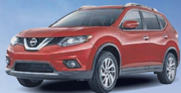
SL AWD Premium model shown*

Lease* or Finance* rates as low as 0% APR 24 months on select models