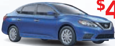
1.8 SR model shown*

$44 WEEKLY ON SENTRA S M6 AT 2.99% APR FOR 60 MONTHS