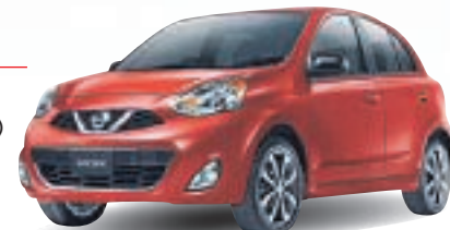
SR AT model shown*