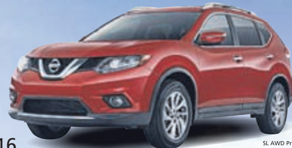
SL AWD Premium model shown*

2016 NISSAN ROGUE* MONTHLY LEASE* FROM $283 WITH $0 DOWN