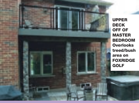
UPPER DECK OFF OF MASTER BEDROOM Overlooks treed/bush area on FOXRIDGE GOLF