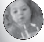
Celebrate a Milestone!