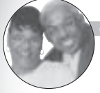
Celebrate a Life well Lived!