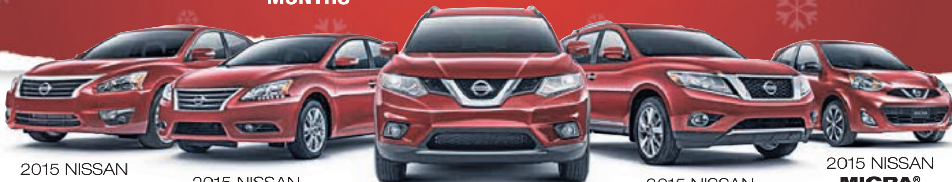
2015 NISSAN ALTIMA