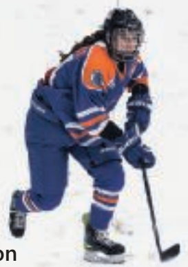
Gold Medalist Natalie Spooner