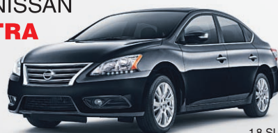
1.8 SL model shown ▲

- TOP SAFETY AND TOP QUALITY ONLY IN 2015 NISSAN SENTRA