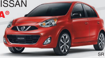
SR AT model shown ▲