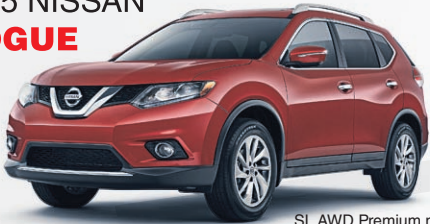
SL AWD Premium model shown ▲