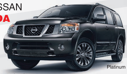
Platinum model shown ▲