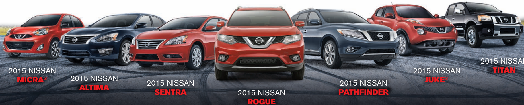
2015 NISSAN MICRA*

CASH DISCOUNTS ON OTHER SELECT 2015 MODELS $14,000 AVAILABLE ON SELECT 2015 TITAN MODELS