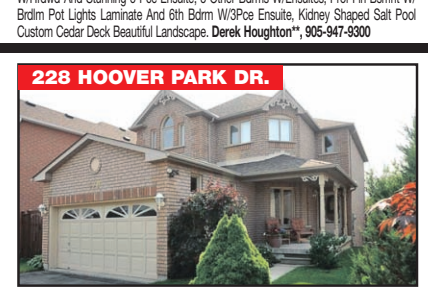
DRIVEWAY PARKING FOR UP TO 6 CARS! - $729,000 Bright 4bdrm family home with neutral decor and finished walk-out basement with laminate floors, kitchen, 3pc wshrm, w/o to deck. Spacious 2 storey entrance, 9'

Unique design with a 20' x 17' family room!! Featuring hardwood floors, main floor office & 9' ceilings. Large eat in kitchen. Huge pie shaped lot 134'!! Close to schools, shopping & 407!! A "10"!! Call Sylvia* or Dave* Houghton, 905-947-9300