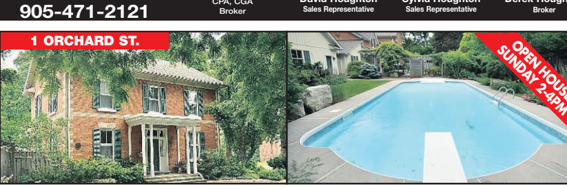
RICH-REGAL- ROYAL!! 118' X 170' LOT!! ~ $1,497,000

Heritage at its finest!! 10' ceilings on main floor, oversized moldings, huge eat-in kitchen. 4 large bedrooms + 4 baths. Prof. landscaped private backyard with in-ground pool & botanical gardens. Walk to Markham Main St., GO transit & shopping!! Call Sylvia* or Dave Houghton** 905-947-9300