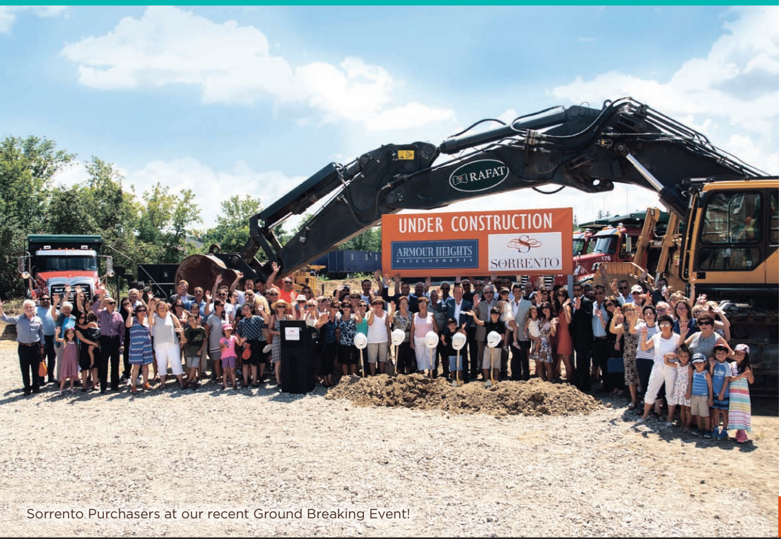
Sorrento Purchasers at our recent Ground Breaking Event!

Renderings are Artists concept. Prices & info subject to change without notice. E.&O.E.