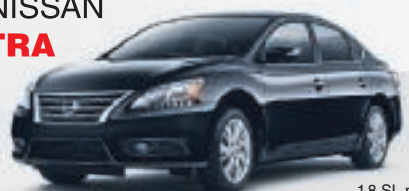
1.8 SL model shown ▲

- TOP SAFETY AND TOP QUALITY ONLY IN 2015 NISSAN SENTRA