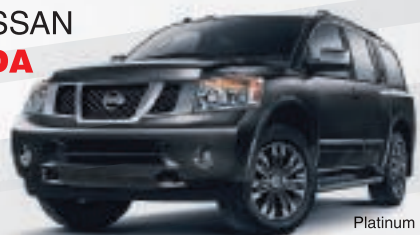
Platinum model shown ▲