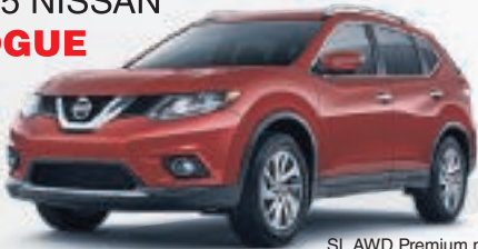
SL AWD Premium model shown ▲