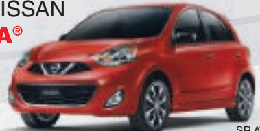
SR AT model shown ▲