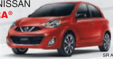
SR AT model shown ▲