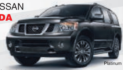
Platinum model shown ▲