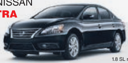
1.8 SL model shown ▲

- TOP SAFETY AND TOP QUALITY ONLY IN 2015 NISSAN SENTRA