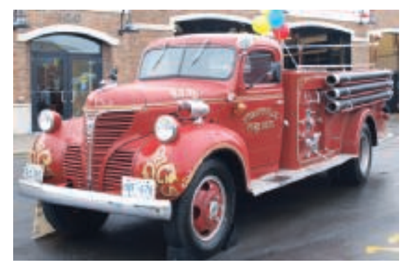
All proceeds go to the restoration of the 1946 Fargo fire truck

Firefighter car wash, BBQ Hamburgers and hotdogs, dunk a firefighter! Music, Sparky the Fire Dog, prizes, fun for the whole family.