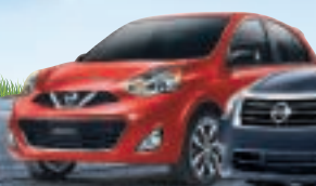
2015 NISSAN MICRA*

ON SELECT 2015 MODELS $8,500 AVAILABLE ON SELECT 2015 ARMADAS