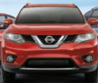
2015 NISSAN ROGUE