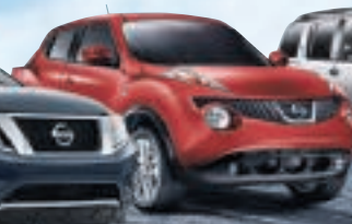
2015 NISSAN JUKE*