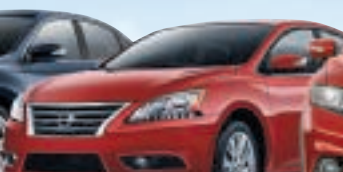
2015 NISSAN SENTRA