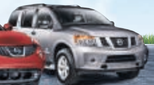
2015 NISSAN ARMADA

CURRENT NISSAN OWNERS QUALIFY FOR UP TO AN ADDITIONAL $1,000 †† LOYALTY CASH ON SELECT MODELS - ENDS AUGUST 31 ST