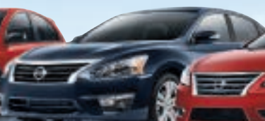
2015 NISSAN ALTIMA