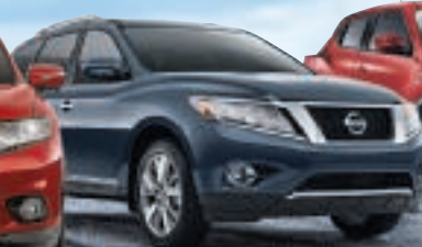
2015 NISSAN PATHFINDER