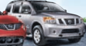
2015 NISSAN ARMADA

CURRENT NISSAN OWNERS QUALIFY FOR UP TO AN ADDITIONAL $1,000 †† LOYALTY CASH ON SELECT MODELS - ENDS AUGUST 31 ST