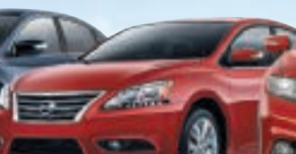
2015 NISSAN SENTRA