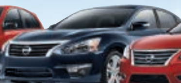
2015 NISSAN ALTIMA