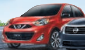
2015 NISSAN MICRA*