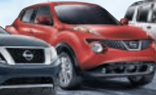
2015 NISSAN JUKE*