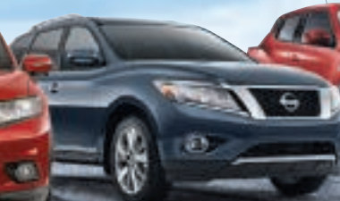
2015 NISSAN PATHFINDER