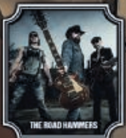
THE ROAD HAMMERS

TEXAS STYLE BBQ ★ SILENT AUCTION ★ PROSPECTOR'S RAFFLE