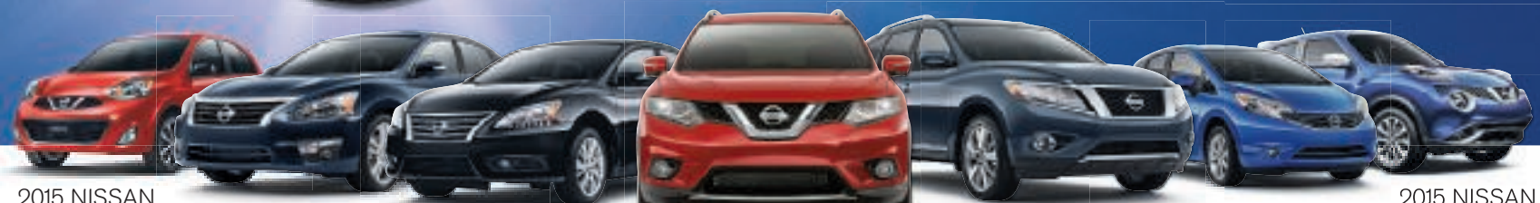
2015 NISSAN MICRA®

NO CHARGE EXTENDED WARRANTY PLAN 3 UP TO A $2,000 VALUE