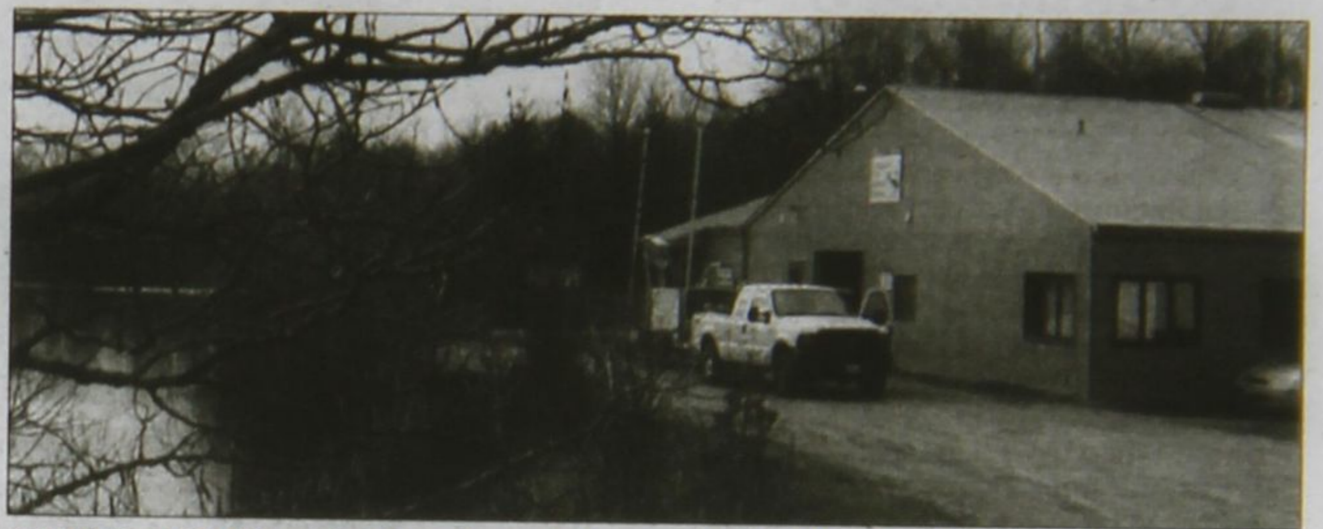
SPRING RITUAL - This truck, parked outside the Ringwood Fish Culture Station, hauls a large tank, which is being loaded by means of large plastic tubes, with 50,000 young salmon destined for the Don and Humber river basins.