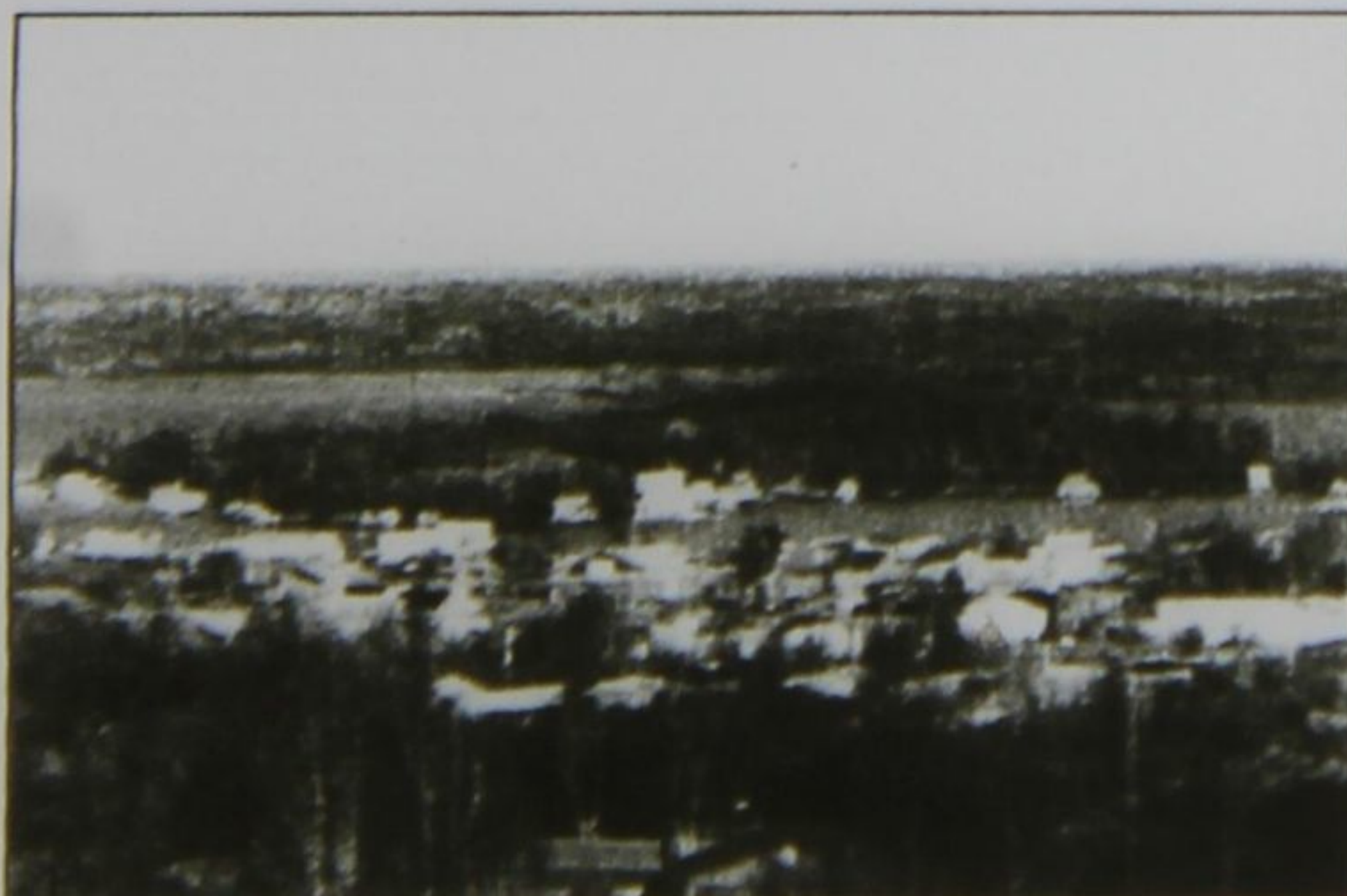
A view of old Yellowknife in the fall.

Open Evenings & Weekends for Your Convenience