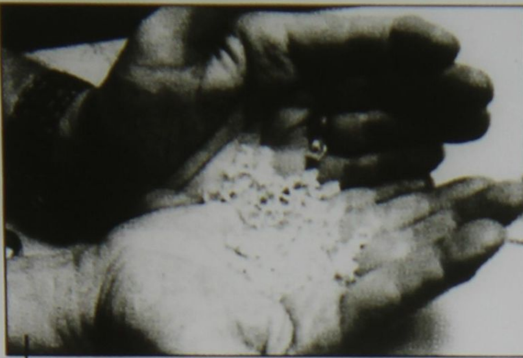
Two hundred and ten carats of rough diamonds from Victor Mine just west of James Bay, Nunavut.

"We now have the largest yielding diamond mine in the world. And Canada only started mining diamonds 12 years ago."