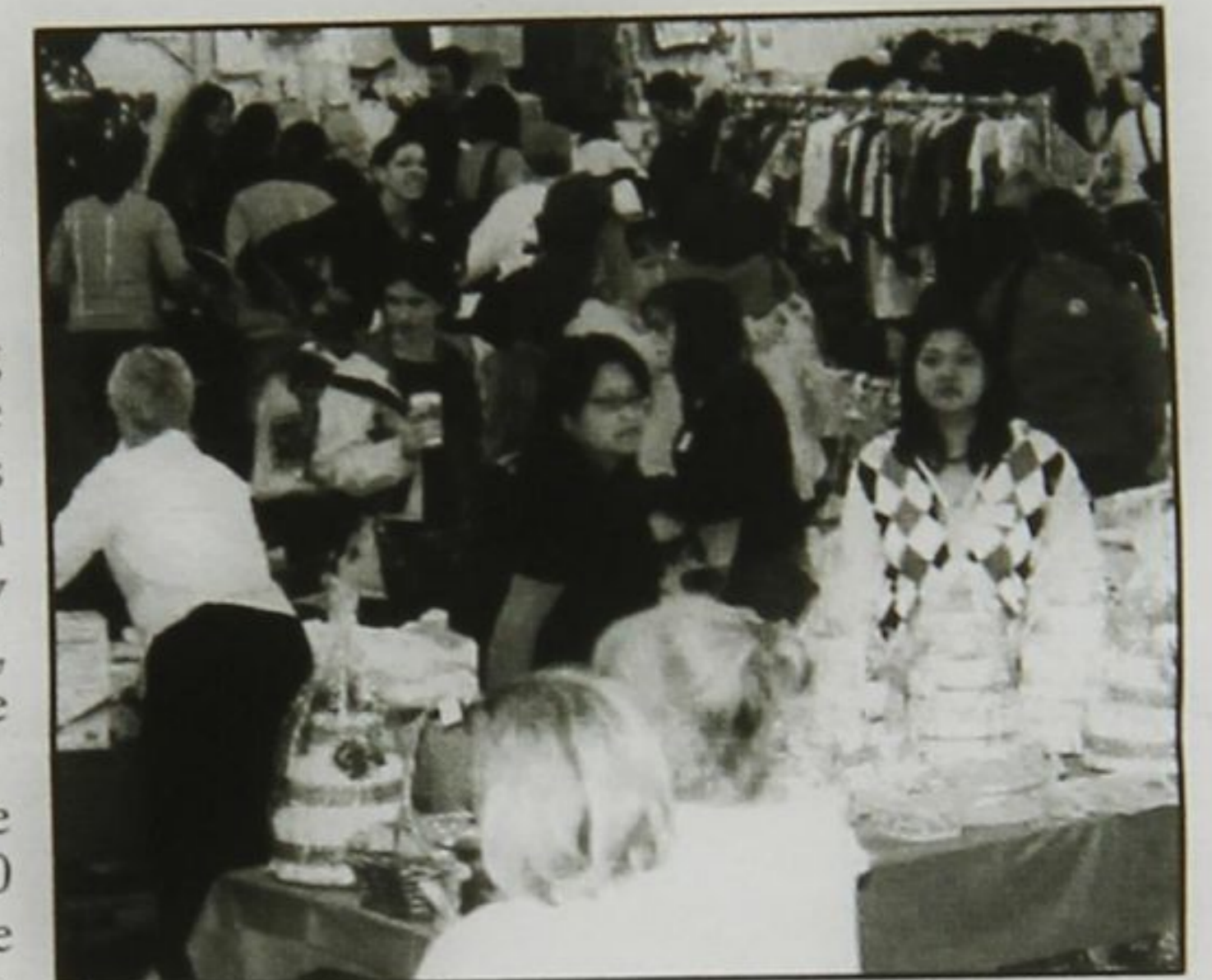
Bargain hunters check out the tables at the spring Mom to Mom sale at Markham Fairgrounds. The fall sale takes place Nov. 7.

The sale runs from 9 a.m. to 1 p.m. For details visit www.momtomsales.org .