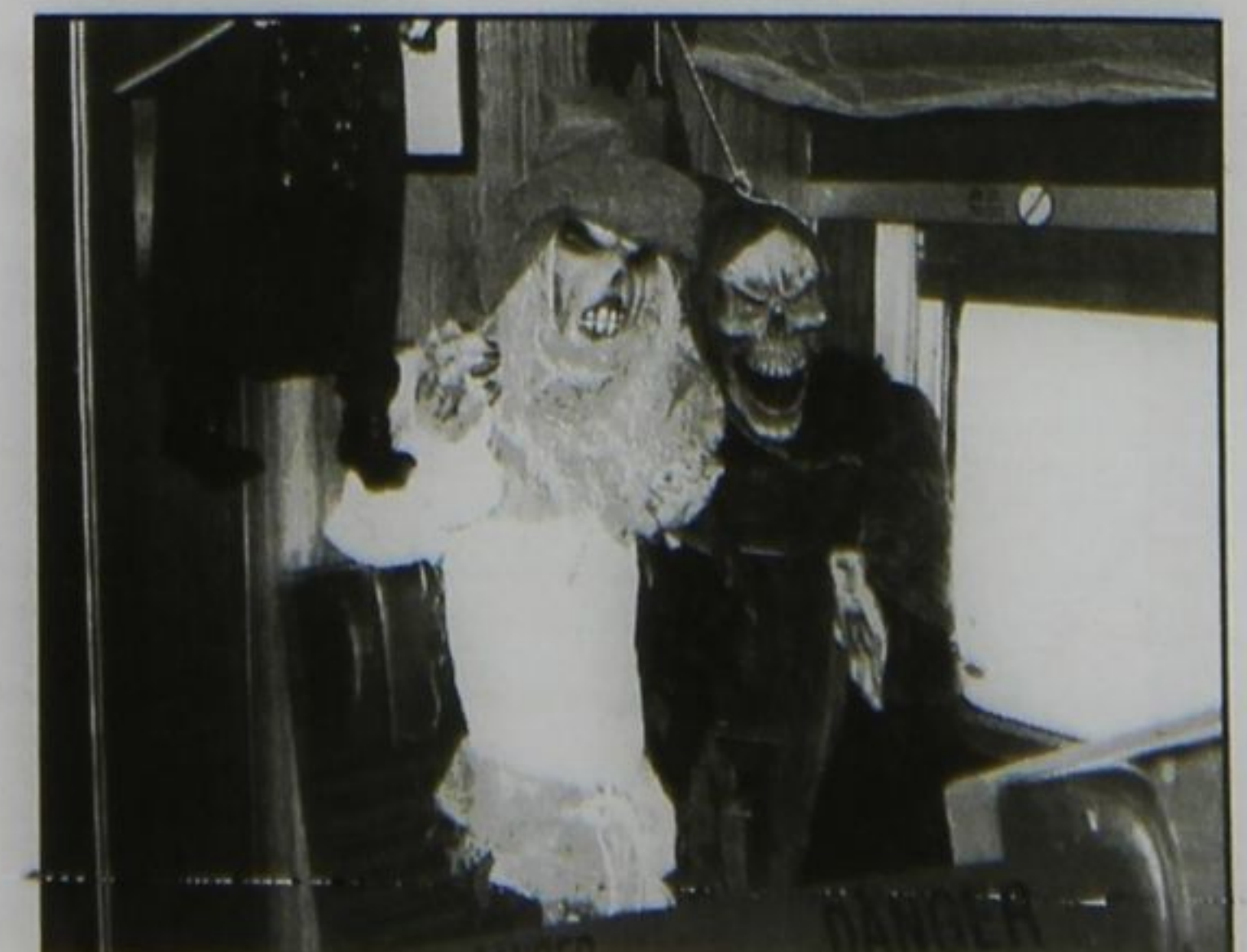
Spooky passengers haunt the Halloween train.

For more information visit www.ydhr.on.ca or call 905-852-3696.