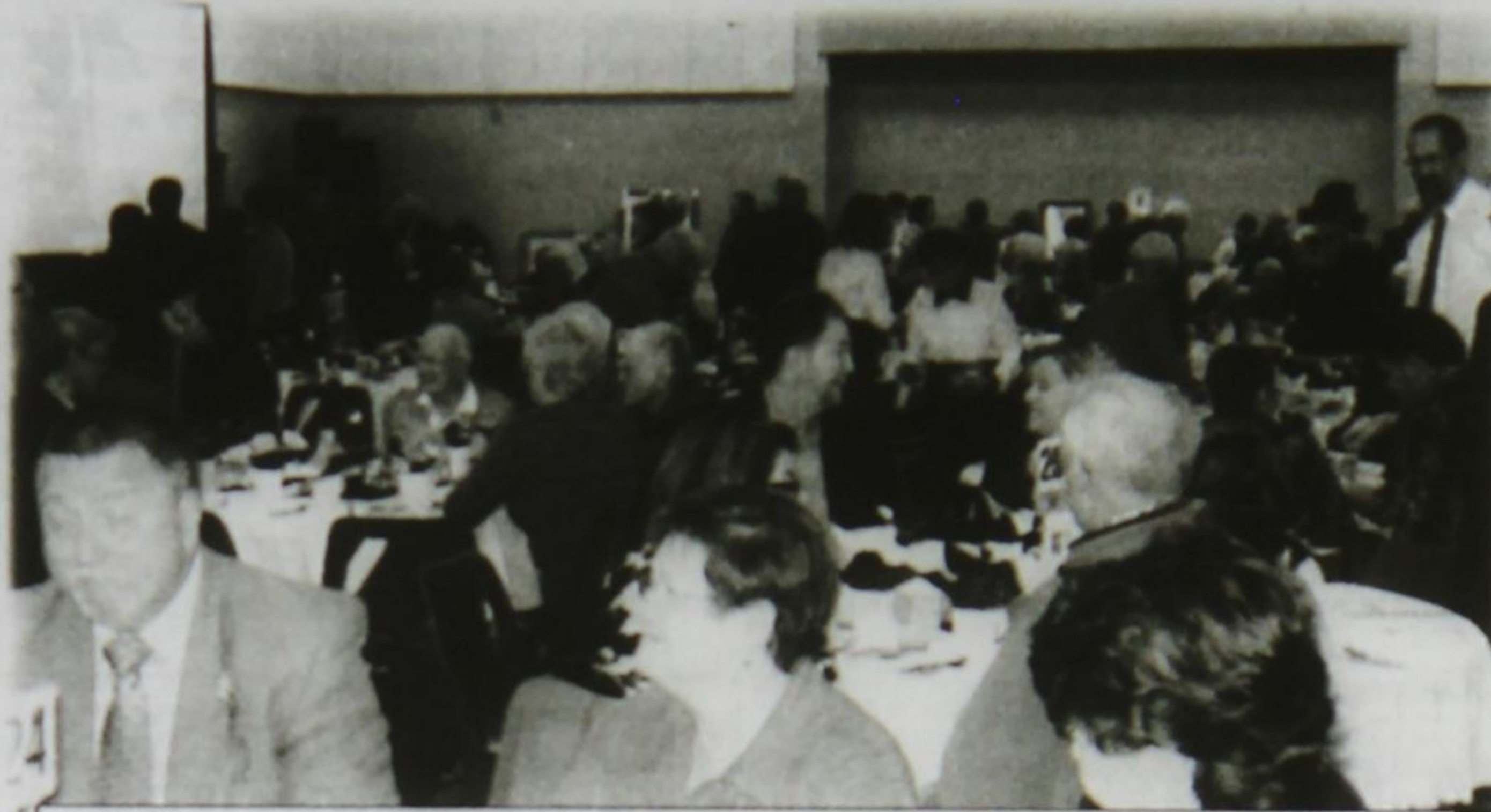
A large crowd filled the auditorium at EastRidge Missionary Church at the SIP fundraising dinner in October.