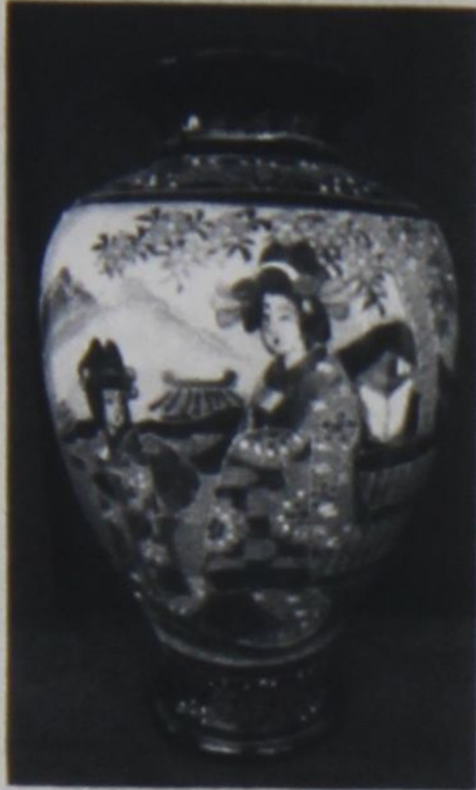
Satsuma Vase Circa 1910

With more to explore at Reid's you never know what you will find, from antiques, books, collectibles & ever-changing eclectic items. We are always pleased to buy or consign your quality items.