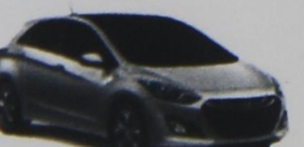
Inventory is limited. Dealer order may be required. SE with Tech shown.

GET UP TO $2,350 IN PRICE ADJUSTMENTS* + 0% FINANCING FOR 24 MONTHS