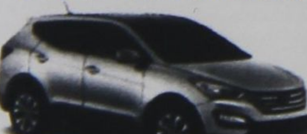
Inventory is limited. Dealer order may be required. Limited model shown.

OWN IT FOR $139 BI-WEEKLY WITH 0.99% FINANCING FOR 96 MONTHS NO MONEY DOWN INCLUDES $500 IN PRICE ADJUSTMENTS*