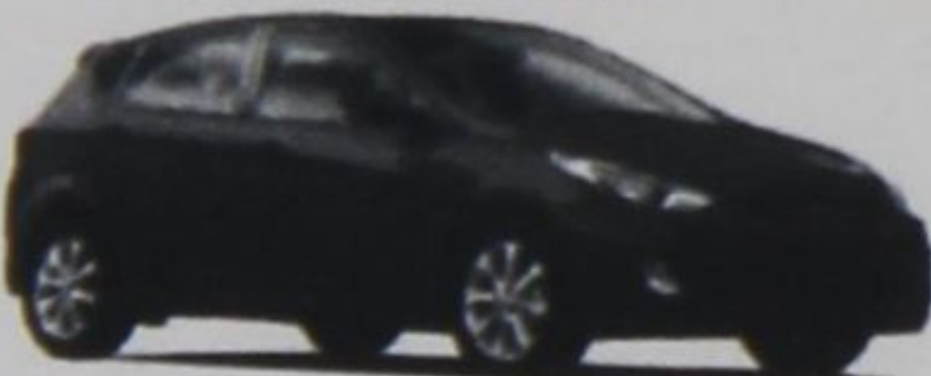
Inventory is limited. Dealer order may be required. GLS model shown.

OWN IT FOR $73 BI-WEEKLY WITH 0% FINANCING FOR 96 MONTHS NO MONEY DOWN INCLUDES $200 IN PRICE ADJUSTMENTS*