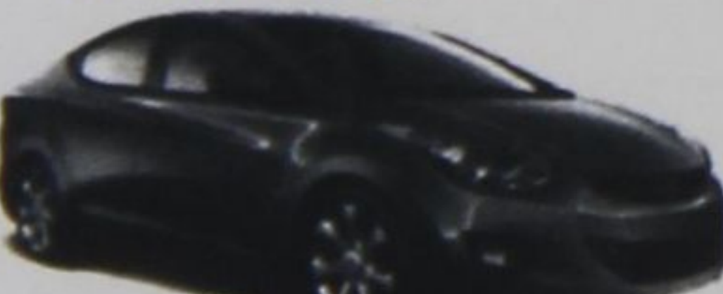
Inventory is limited. Dealer order may be required. Limited model shown.

OWN IT FOR $82 BI-WEEKLY WITH 0% FINANCING FOR 96 MONTHS NO MONEY DOWN INCLUDES $500 IN PRICE ADJUSTMENTS*