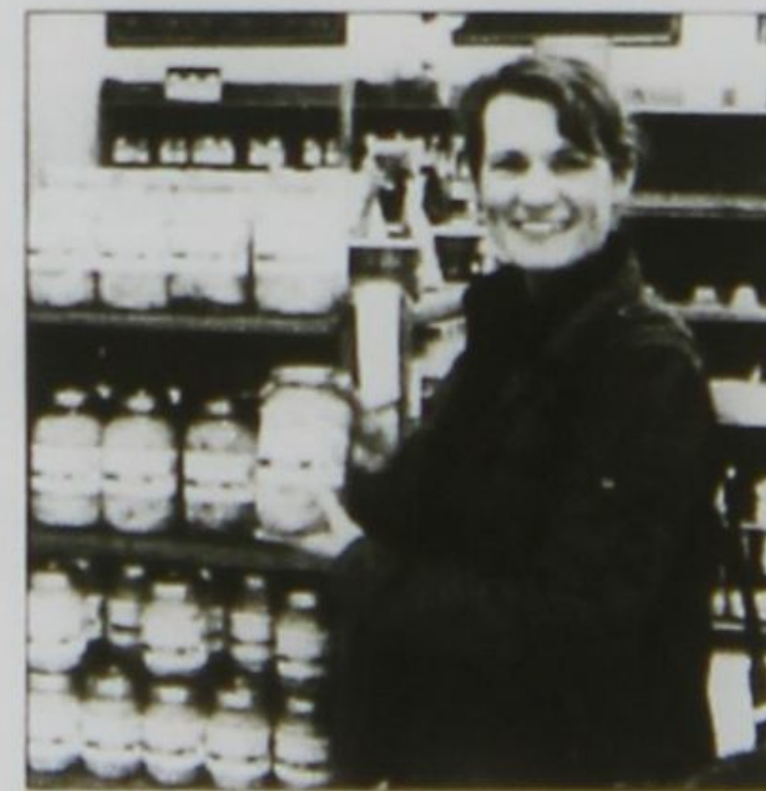
It's good to know your food!