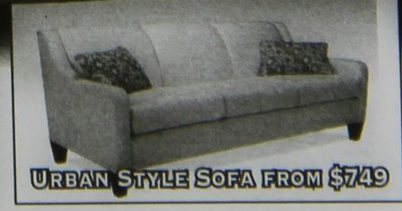
URBAN STYLE SOFA FROM $749

Choice of Fabrics and Leather • All Made in Canada