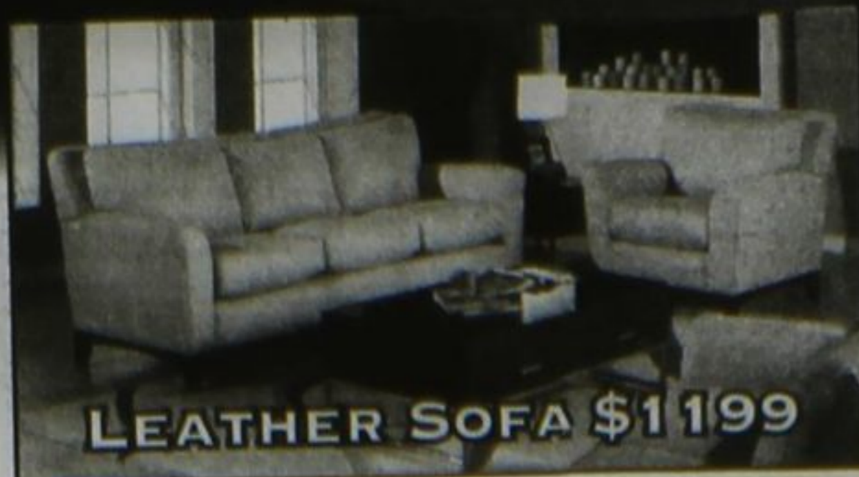
LEATHER SOFA $1199