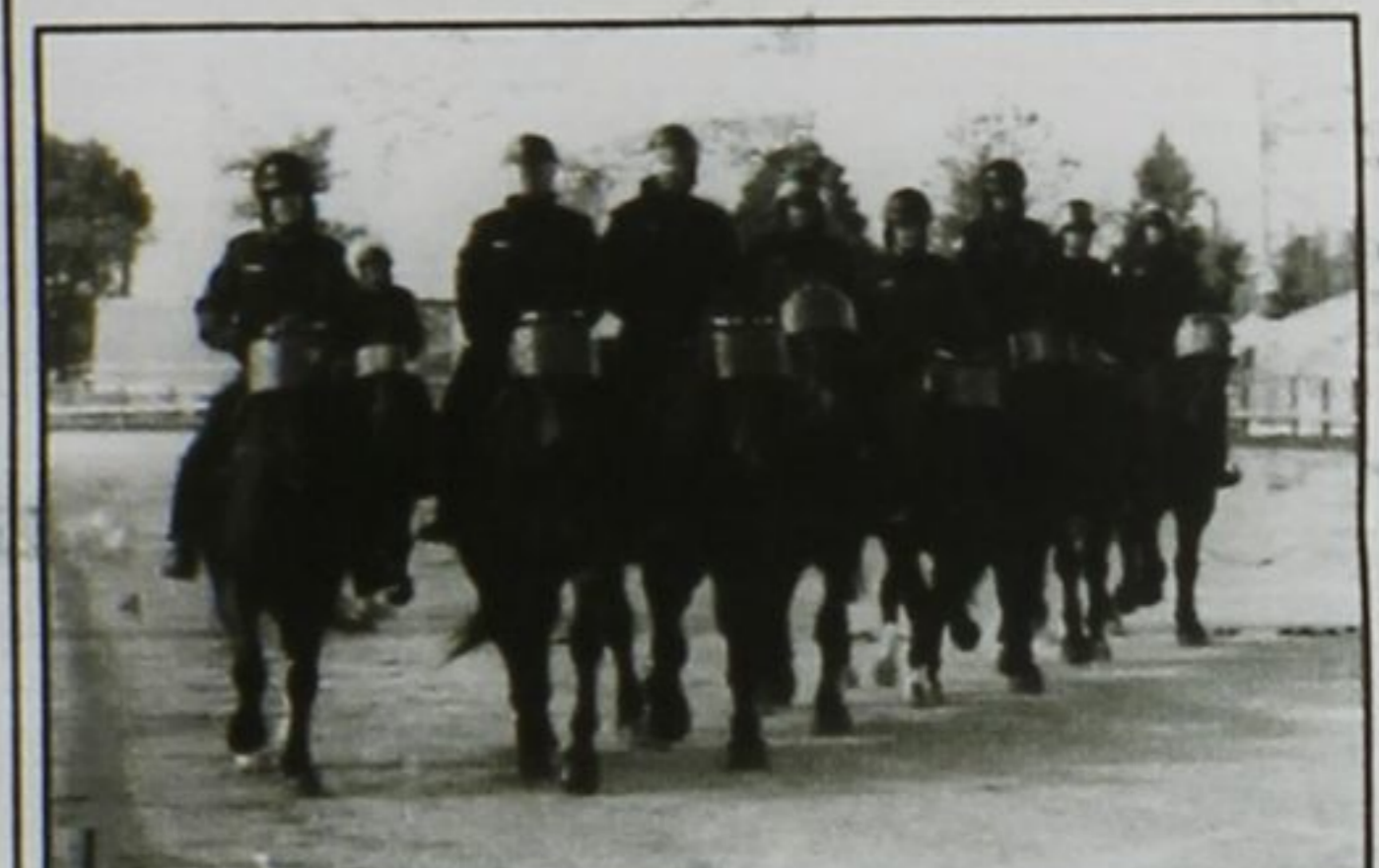
The Toronto Mounted Police Unit will be featured at Markham Fair, which runs Oct. 1 to 4 at the Markham Fairgrounds