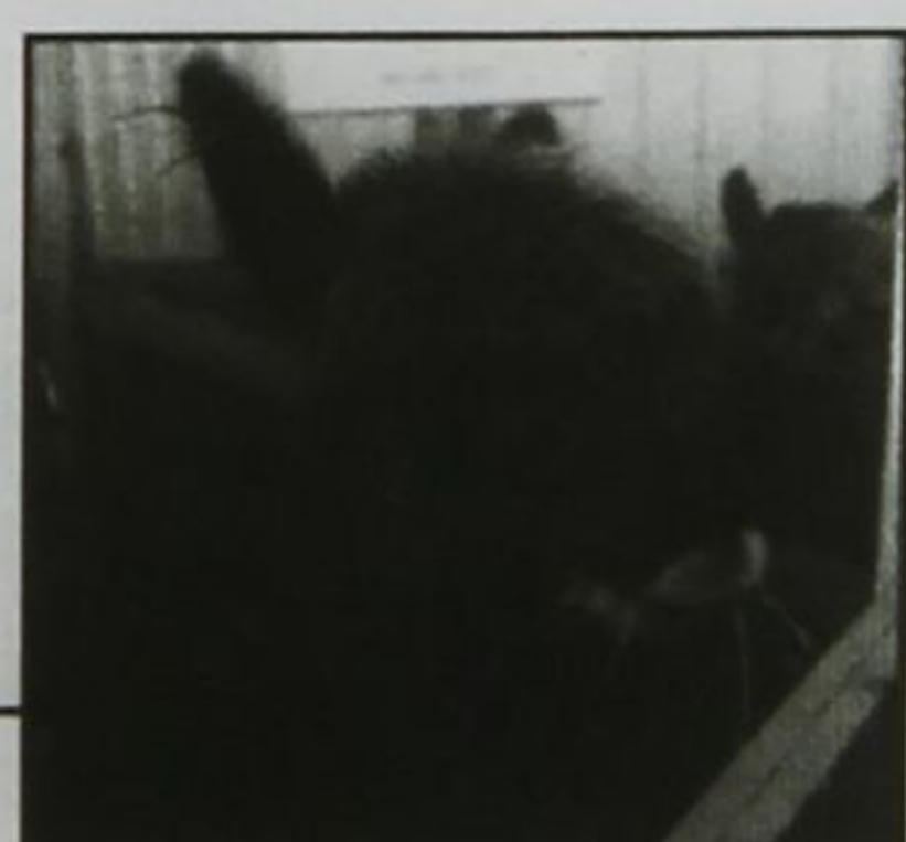
Chewing things over