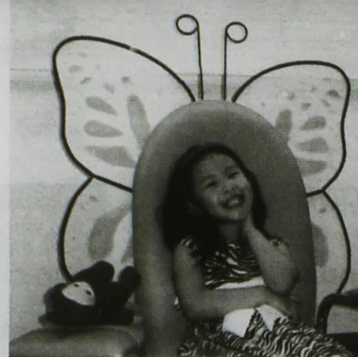
Yangyang Princess of the Month

905-591-1568 • 18 Ringwood Drive, Stouffville