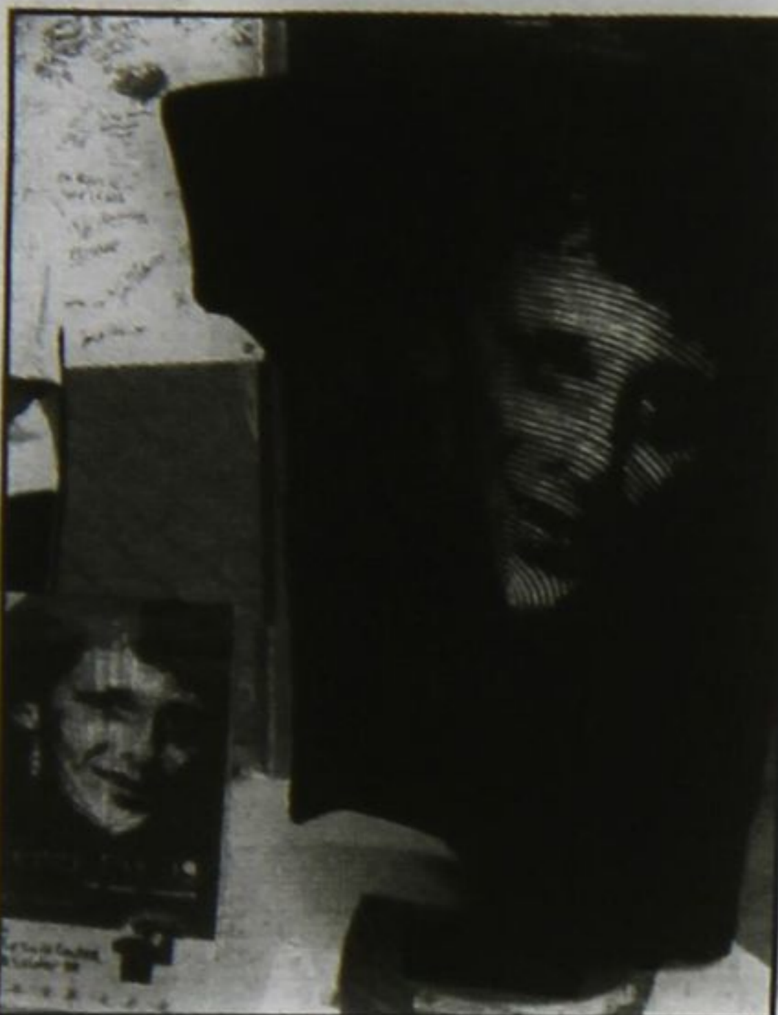
The snazzy Terry Fox T-shirt for 2009.