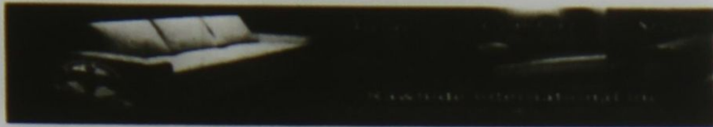
Top & Full Grain Leather and Fabric

Custom Built to suit your needs - Choose from over 140 styles Sofas, Love Seats, Sectionals, Recliners, Accent Chairs, Sofa Beds, Ottomans, Theatre Seating - All Available in Condo/Apartment size to your requirements/measurements