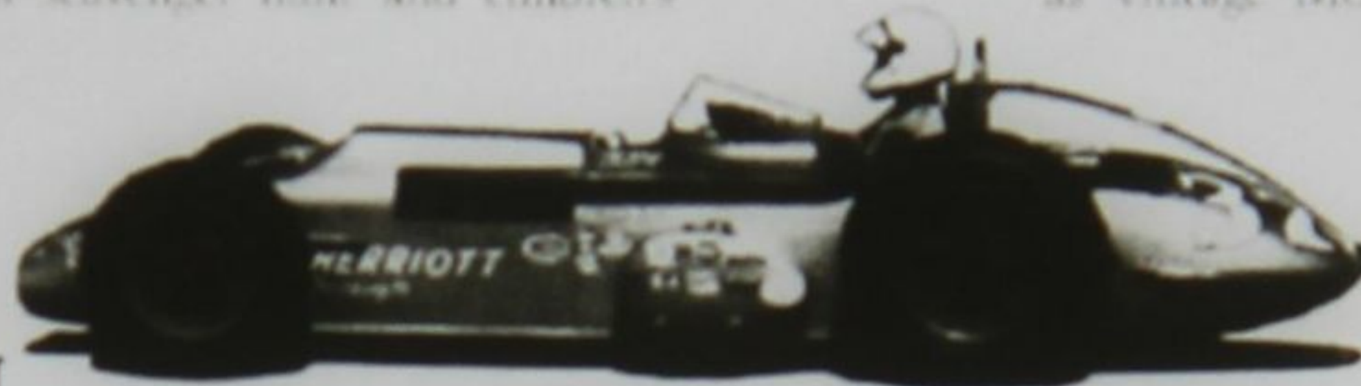
This 1959 Kurtis 500J McKay Special Indy car, which will be on display at the Museum Car Show Aug. 8, is an auto enthusiast's dream, being one of only two manufactured by Kurtis-Kraft in 1958.

Whitchurch-Stouffville Museum is located at 14752 Woodbine Ave. north of Vandorf Sideroad. For more information call 1-888-290-0537 or visit www.townofws.com/museum .