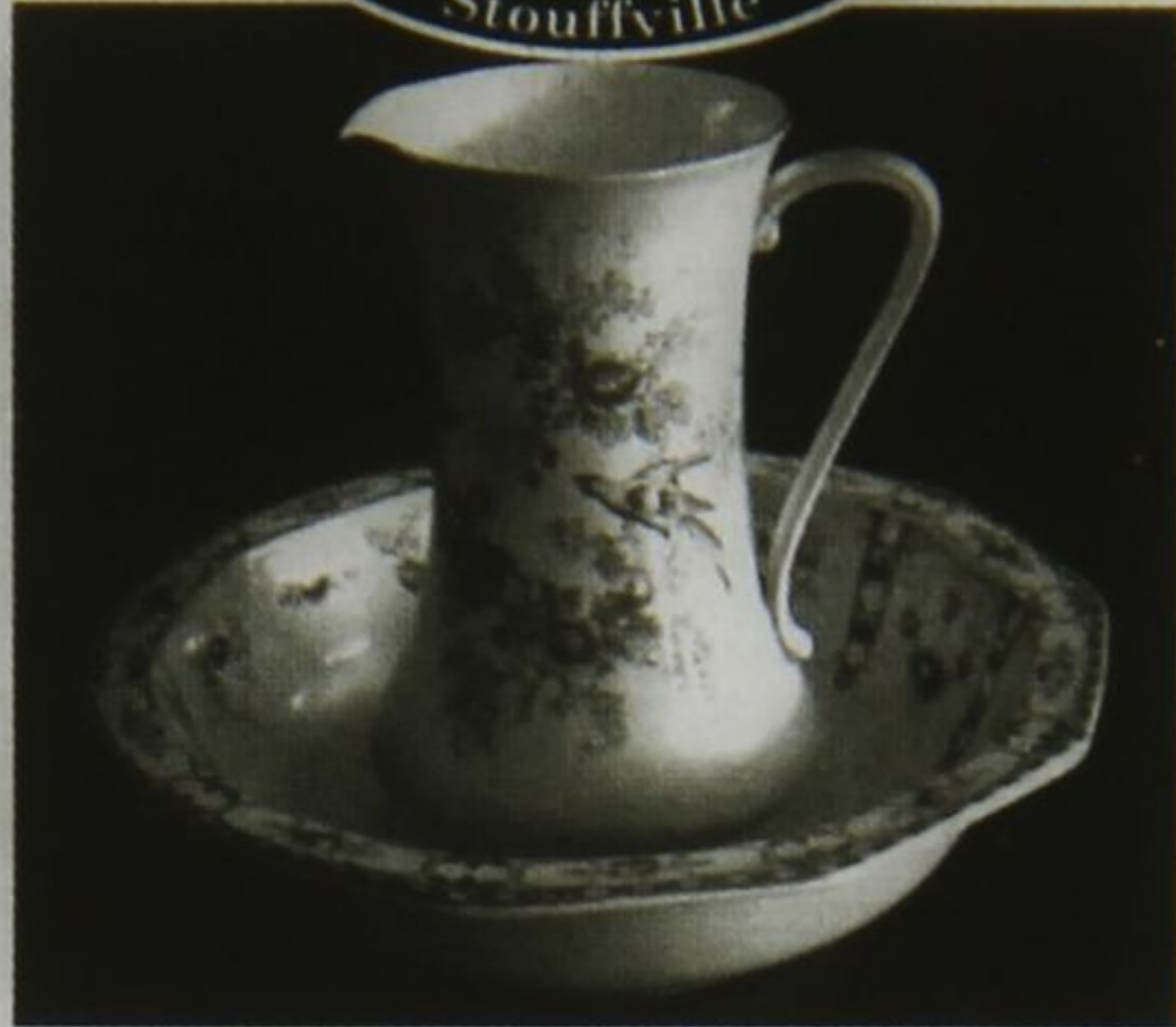
Pitcher and Basin circa 1940