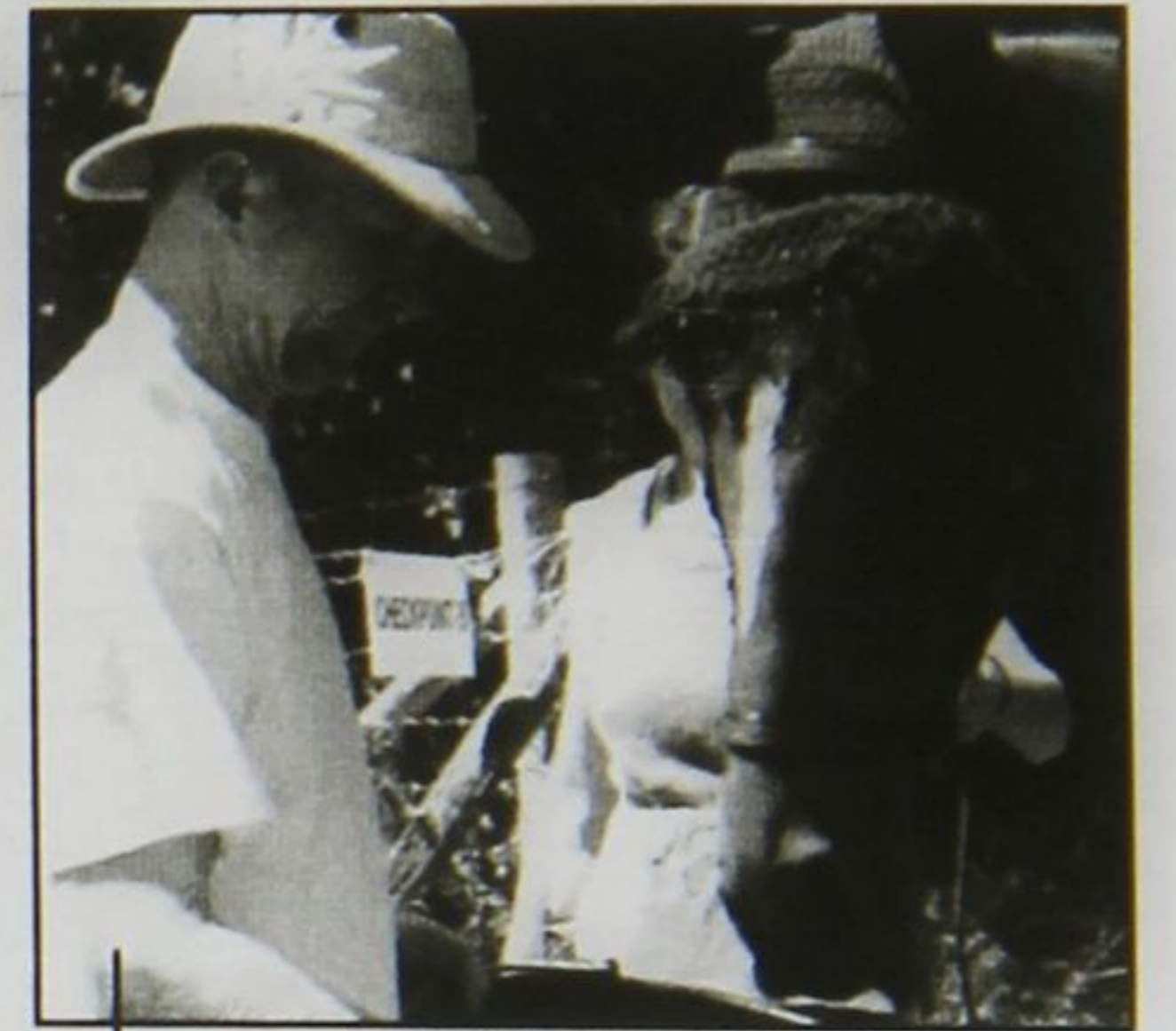
Horsing around at the Al Humphrey Memorial Ride. This year's event takes place Aug. 2 from Al's Tack Shop.