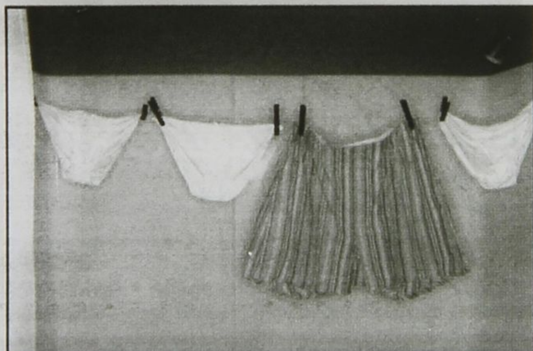
Your Choice of Coverage ...