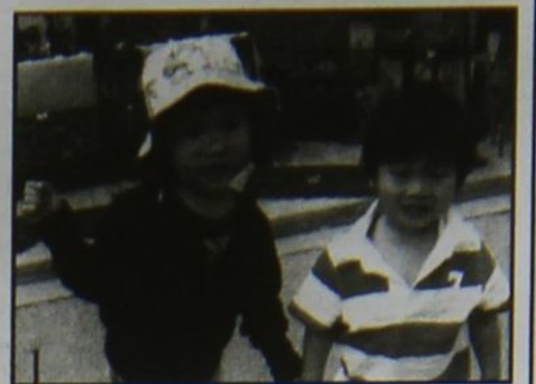
Two young visitors enjoy a walk down Main St. July 4.