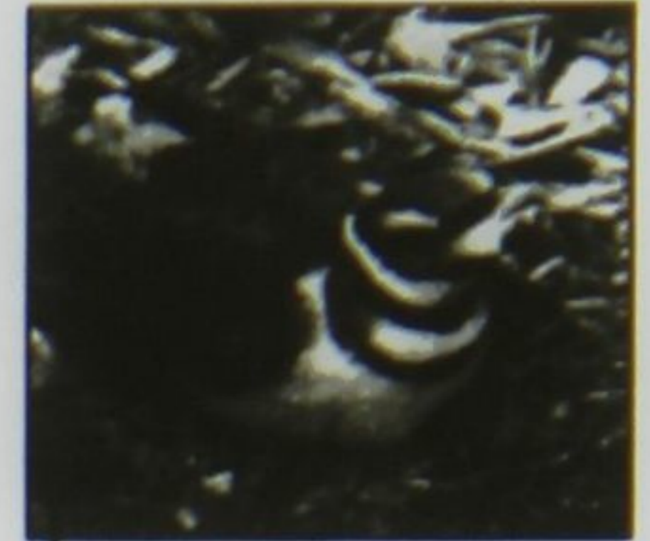
A killdeer makes her home beside a local pond.