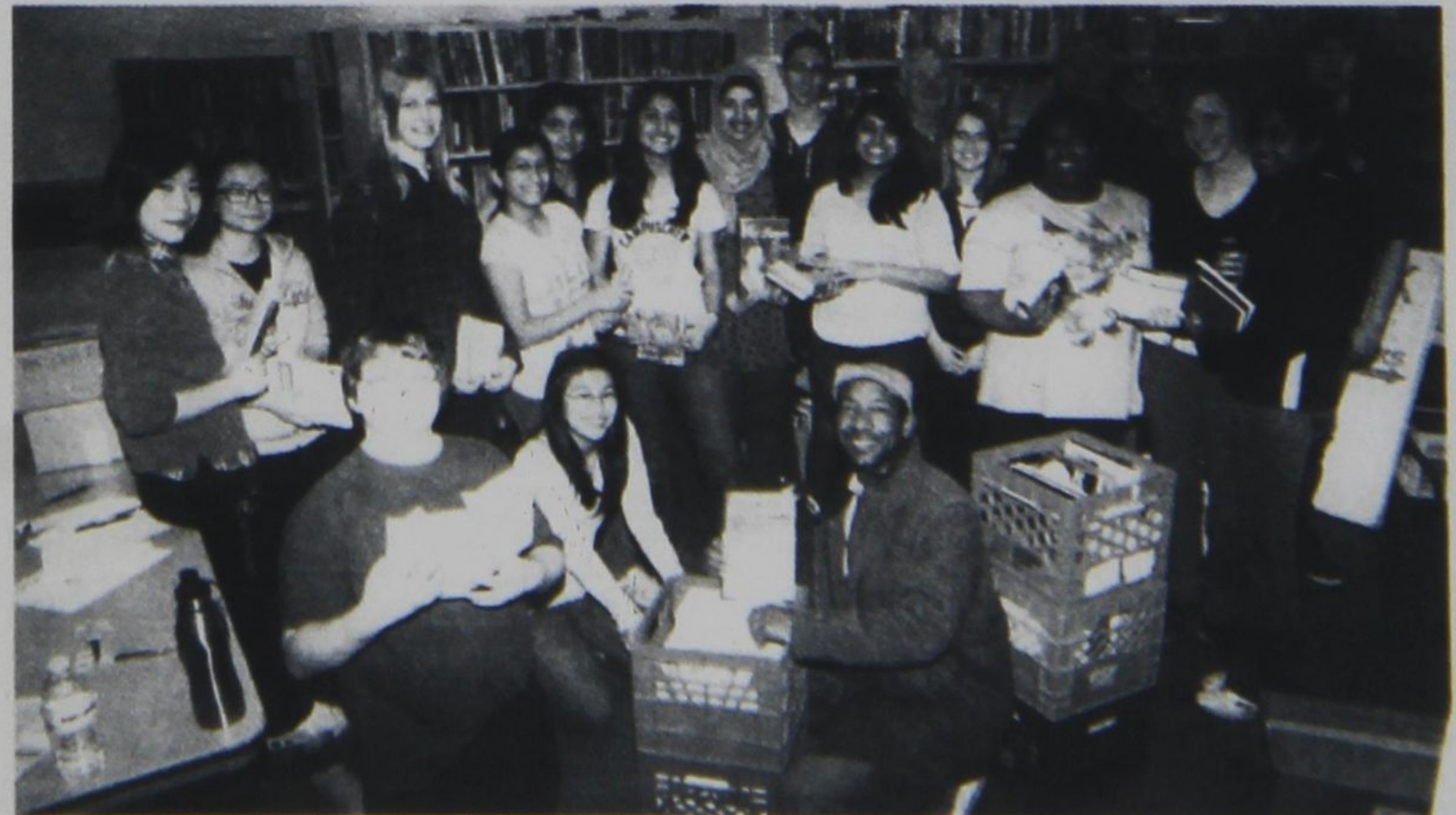
Local students and members of the Stouffville Kinsmen (above) were among the many volunteers who helped out at Whitchurch-Stouffville Library's Giant Book Sale which took place March 28 to April 1. The facility's largest annual fundraiser netted an impressive $14,837 for library programs and events.