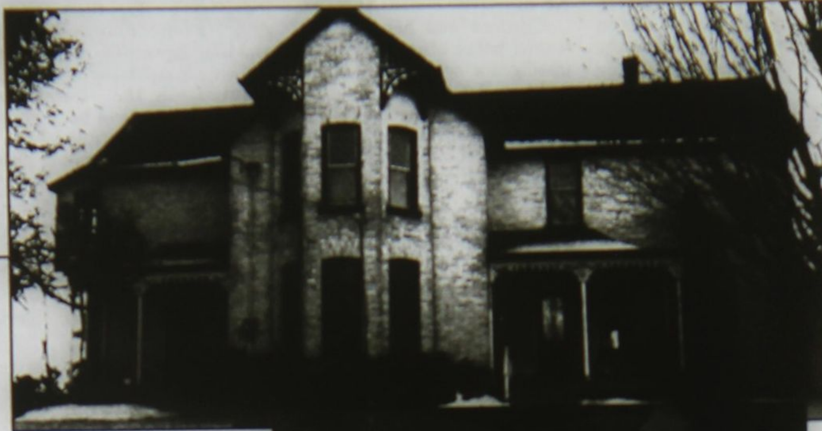
James Lemon House & Woodworking shop

LEMONVILLE COMMUNITY CENTRE 13453 McCowan Rd.