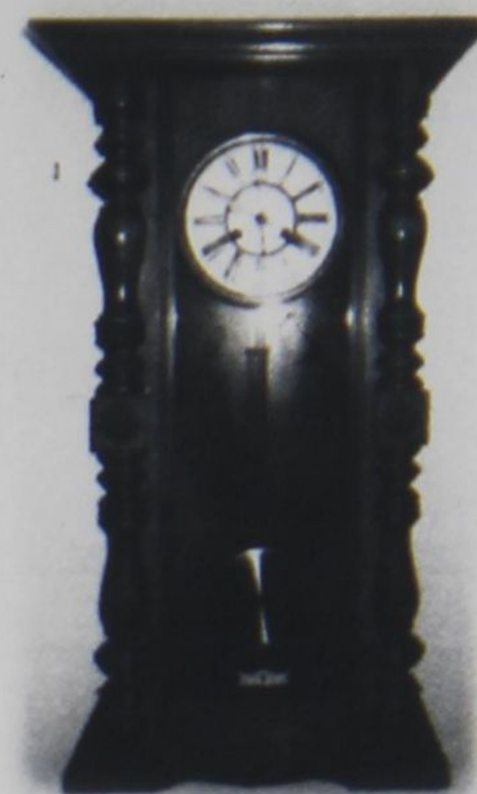
D.R. Kienzle Wall Clock circa 1907

With more to explore at Reid's you never know what you will find, from antiques, books, collectibles & ever-changing eclectic items. We are always pleased to buy or consign your quality items.